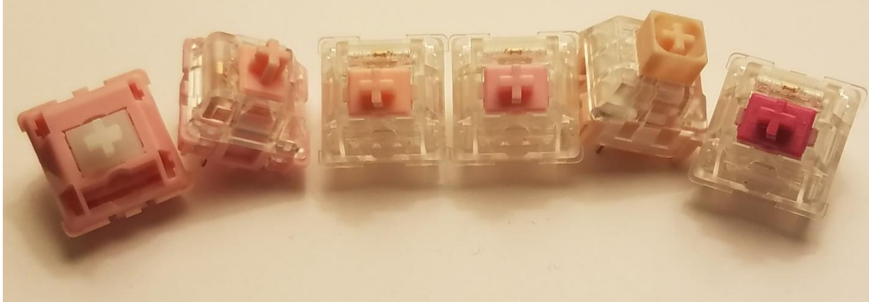
Figure 2: Comparison of pink switches. (Left to Right: Okomochi, Punchy Pink, Sakurio, Rosélio, Novelia, and Aliaz 100g.)

The pink color of the outside housing is identical to the samples pictured in the original groupbuy form, and in person they are quite a bright shade of pink. I could easily see these going well, in a color scheme build, with something like GMK Peach Blossom, which goes on sale here in a couple weeks on January 2 nd , 2020 or DSA Hana. While there are several other pink colored switches already out there, I would say that the pink color of the housing is extremely close to that of Punchy Pink switches.