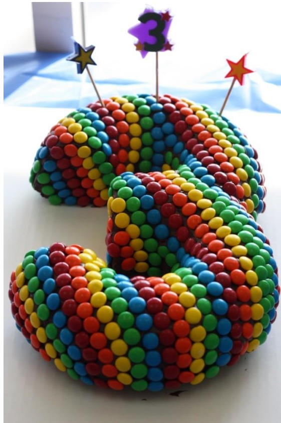
Figure 1: Don't worry, I really splurged out on the cake this year.

It's really hard to believe it, but another trip around the sun has come and gone since I started writing reviews for this website. That's right, the website is officially three years old as of today, and even trying to wrap my head around it is a bit of a struggle to say the least. Over the course of the past several years I've graduated, went to graduate school, graduated once more, and had all manner of jobs in between each of those. Even as I crisscrossed between jobs and states the only thing that has remained constant in that span of time has been overly wordy switch reviews. It's crazy to think that is the case. While I often say that I would continue to do this even if I didn't have anybody reading, rest assured that your support, readership, and kind words over the past few years have been one of the biggest reasons I've been able to maintain it all given my never-stationary lifestyle. Let's have some cake to celebrate!