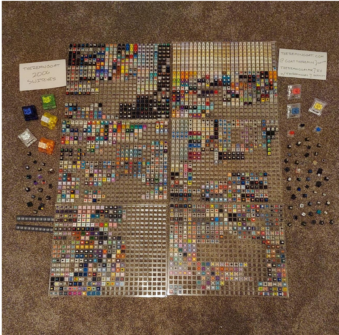
Figure 4: The official switch collection family photo as of 2006 different mechanical keyboard switches!

There's honestly not much that I can say at this point that hasn't been spoken for in the content and reviews dozens of times over. As switch options have exploded over the course of the past year, and my supporters are helping me find even more and more niche offerings, I'm lucky to say that I just this week passed the 2000 switch mark officially. This is not counting the world's largest vintage switch collection I assumed care of recently nor all possible combinations of Tecsee Ice Cream switches either. (The latter of the two I only counted as 1 switch rather than the dazzling 192 different combinations the parts offered.) How this will continue to grow over another year of content is entirely beyond my ability to guess, though rest assured I will push for 3000 as hard as I did for the unbelievable 2000 mark! An updated, but not entirely complete family photo can be found below.