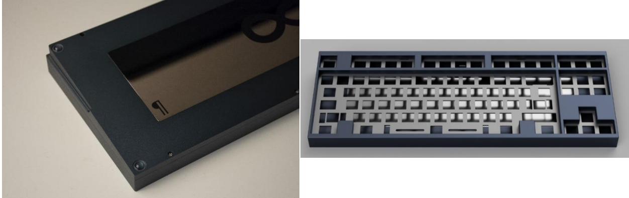
Figure 5: Prototype photograph and render of Eniigma's Infinitum TKL which is still under interest check at the time of writing this document.

A US based, burgeoning keyboard designer, Eniigma is a friend of HHHH who is currently running the western facing interest check for the H1 switches. He was not involved in any part of the design of the pieces, and simply is serving as the person to run the interest check for all of us who don't speak or read Chinese.