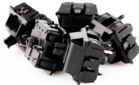
Figure 1: Obsidian switch sample photo from 43 Studios' ZFrontier post.

The switches, which were demonstrated in several marketing style photographs, featured matte black nylon housings and black, POM stems eerily reminiscent of Cherry MX Black switches. In addition to this, while not shown in any of the marketing pictures, the side of the top housings of these switches apparently boasts and engrave '43' after the name of their designer. The springs in these switches are supposedly black and have a 62g bottoming out force, though no pictures of them were included in the original ZFrontier post. Selling for 3.3 Yuan (or roughly $0.47) each, these were available between January 14 th and February 14 th via a QQ style groupbuy.