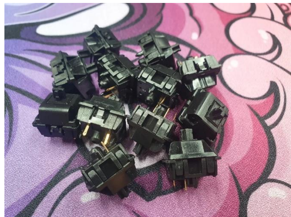
Figure 2: Picture of Korean H1 samples from Enigma's IC post.

Originally, the H1 switches made their debut in Korea in early January of 2020, being sold by HHHH who is a keyboard designer and vendor out of Korea. Much like their Cherry MX Black inspirations, these switches also featured matte black, polycarbonate over polyamide housings with a matte black, POM stem. (It's worth noting here that while Polyamide is not necessarily Nylon, Nylon is the name for the family of semi-aromatic polyamides. All Nylon is polyamide but not all polyamides are Nylon.) Featuring 78g, gold plated springs, these switches supposedly are not like original JWK molds, and were modified by HHHH in order to fit his